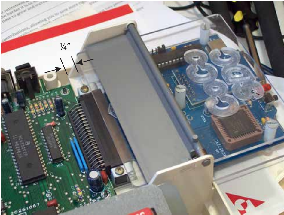
SOB Cartridge in a CoCo