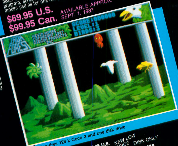
Requires 128 k Coco 3 and one disk drive

$28.95 U.S. NEW LOW PRICE DISK ONLY $38.95 CAN.