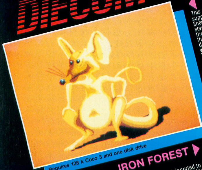
Requires 128 k Coco 3 and one disk drive

$69.95 U.S. AVAILABLE APPROX. SEPT. 1, 1987 $99.95 Can.