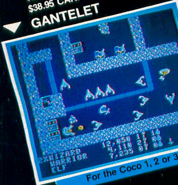
For the Coco 1, 2 or 3